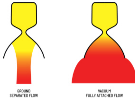
CAPTION: Comparison of (ground) separated rocket engine flow vs (vacuum) fully-attached rocket engine flow

We conducted numerous experimental engine tests with fuel pre-heated to various temperatures to simulate the effect of full attachment. This allowed us to create a more sophisticated thermal model to predict the temperature of the fuel inside the engine with better accuracy than before. This analysis showed that, in flight, the fuel at the injector would have thin margins with respect to its boiling point. The most significant contributors to this thin margin were unique to the Rocket 3 architecture: a pressure-fed upper stage engine that operates at relatively low pressures, as well as the selection of a kerosene-like fuel with a higher vapor pressure than traditional rocket-grade kerosene (e.g. RP-1) to simplify testing and operations.