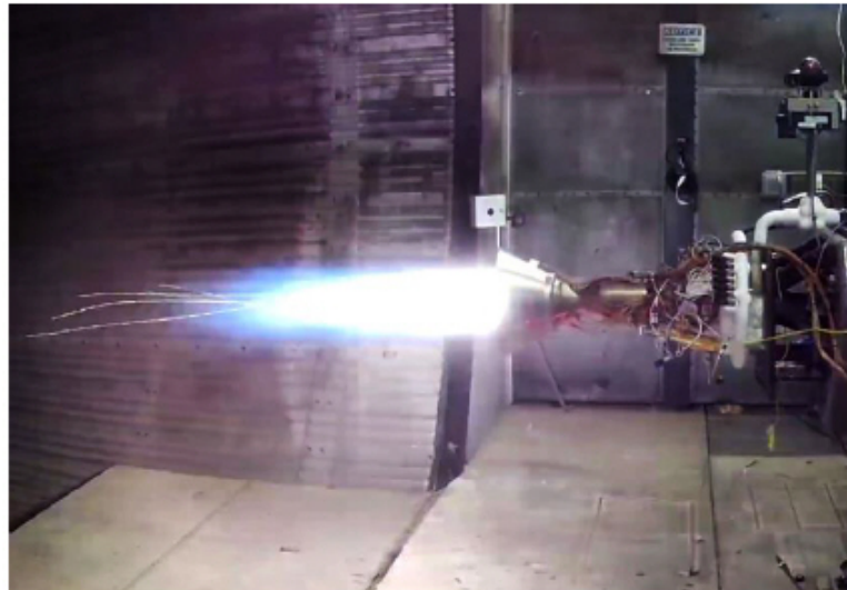
CAPTION: Upper stage engine testing shows streaks of molten metal from a hot wall burn-through event

Given this thin margin, small factors - like the warm sunny weather in Cape Canaveral on the day of launch, which meant the fuel was slightly warmer than in prior flights - helped to tip the fuel over into a boiling regime on the TROPICS-1 mission. Our analysis has concluded that the boiling fuel caused the partial injector blockage in flight and, together with the eroded thermal barrier coating mentioned previously, caused a thermal “run-away” event that worsened the injector blockage and eventually led to the burn-through.